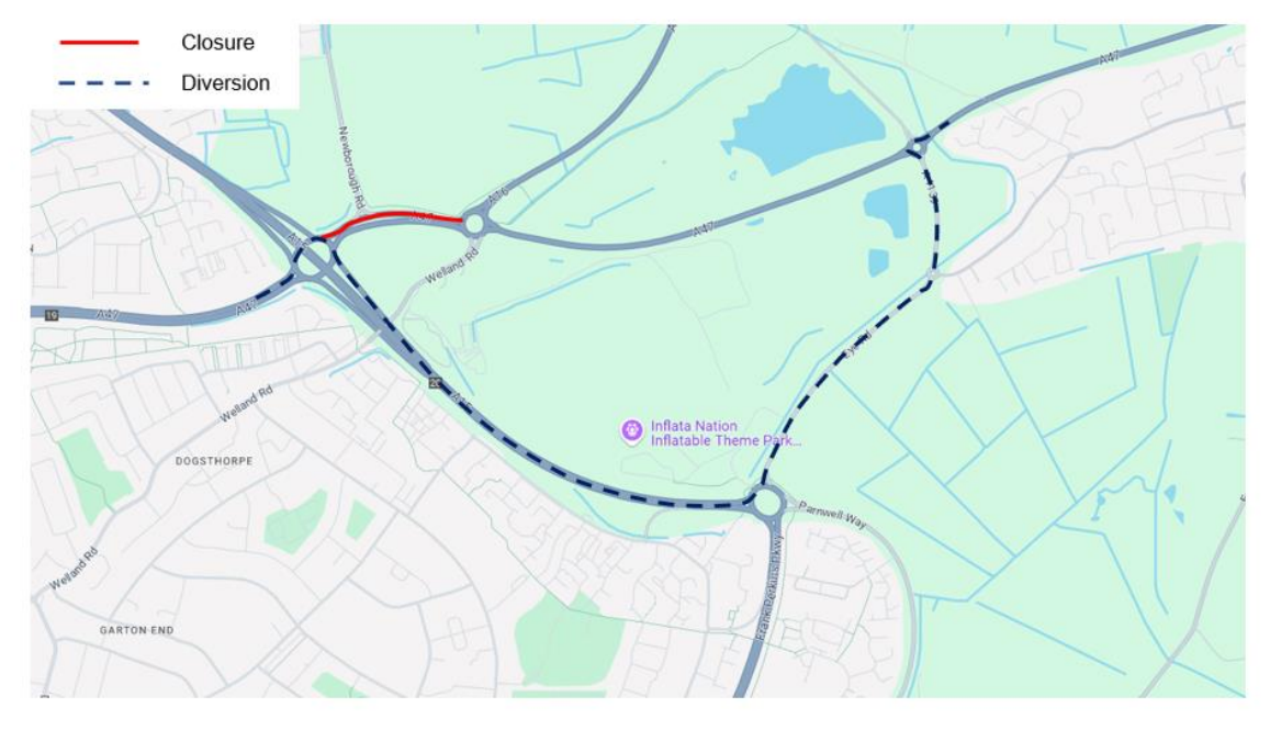
A47 Dogsthorpe Roundabout to Welland Road diversion - map 1